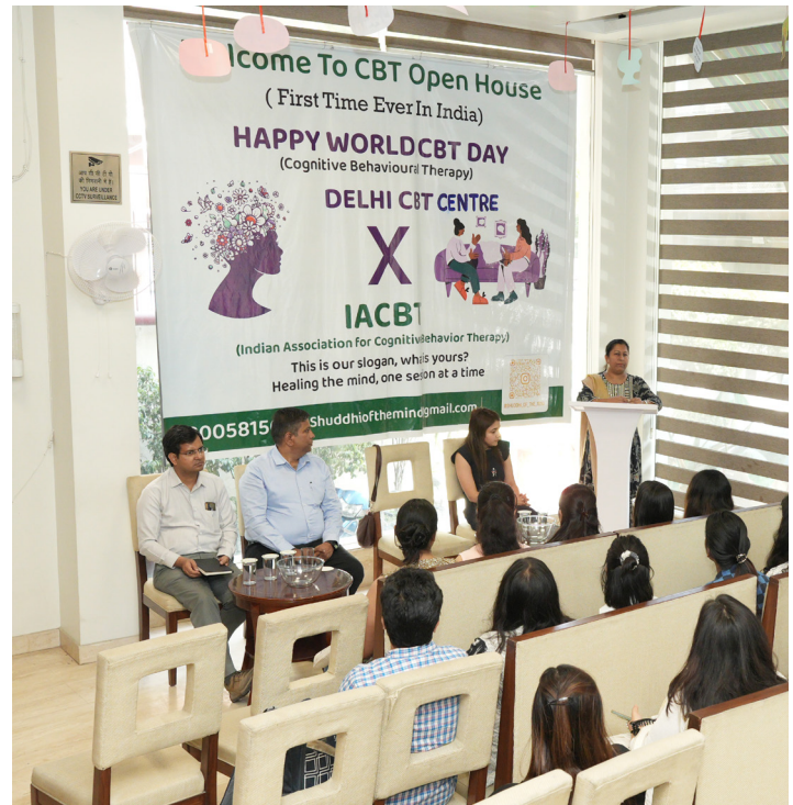
World CBT Day in New Delhi, India

CSKBT (Czech Republic) presented short lectures on CBT, DBT, Schema Therapy and Compassionate Mind Therapy, which were streamed online and promoted by their younger colleagues on various social media platforms.