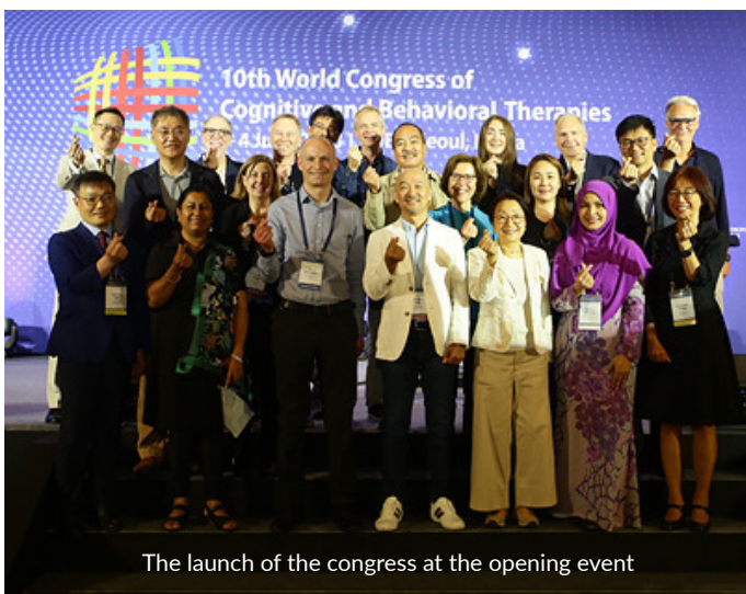
The launch of the congress at the opening event